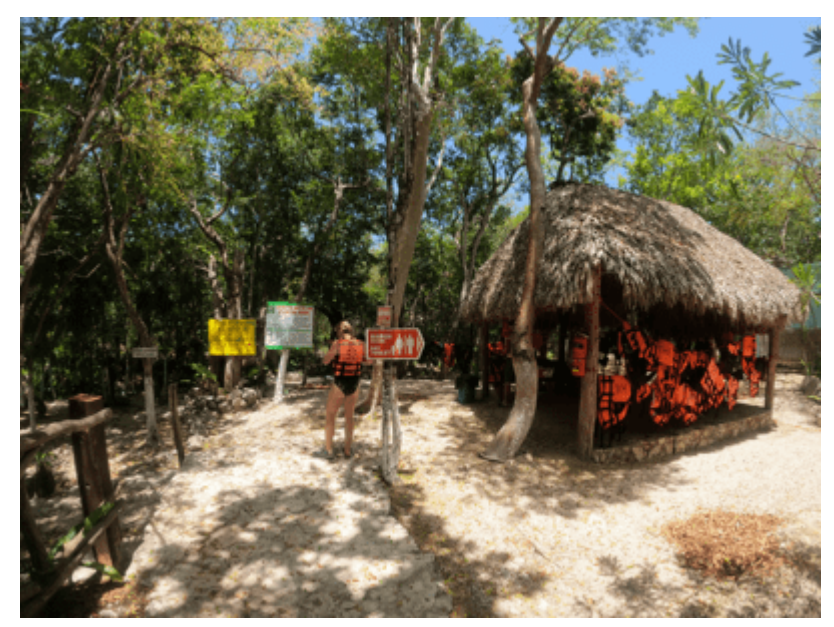
Lifejackets Provided With Admission