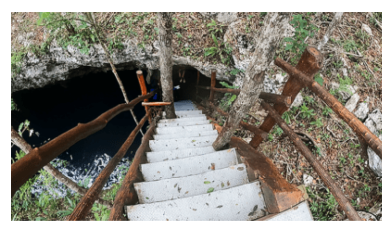
Steep stairs down to the El Pit entrance.

To get into El Pit, you have to go down a very steep flight of stairs to reach a small dock where you can enter the cenote. Scuba equipment is lowered down from the surface using a pully and rope.