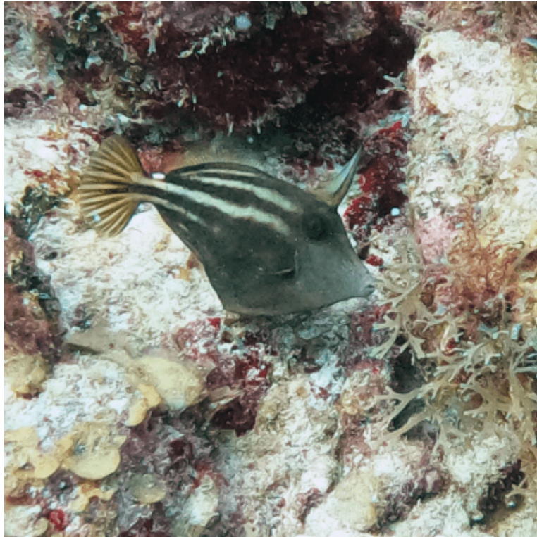
orangespotted filefish, cantherhines pullus

Filefish are typically small to medium-sized fish, reaching a maximum length of about 50 cm (20 inches). They have a thin, flat body with a small mouth and a pair of large, protruding eyes. Their body is typically brightly colored, with patterns of stripes, spots, or blotches. They are equipped with a series of small, sharp spines along their back and sides that they use for defense.