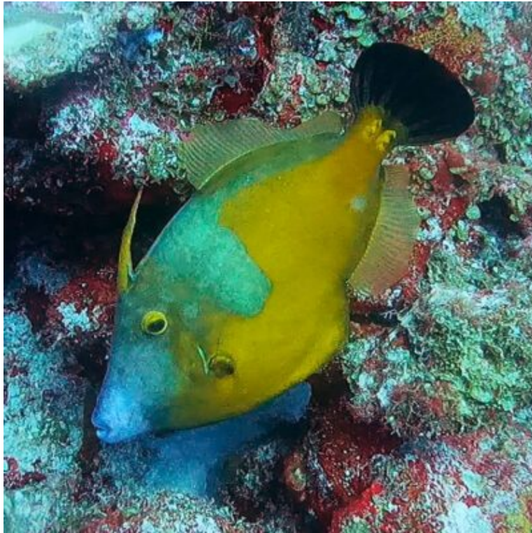
whitespotted filefish, cantherhines macrocerus