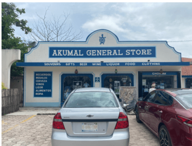
Free Parking To Shop

The Akumal General Store just before the Arch is the largest store in Akumal Playa. They have a wide selection of beverages, include beer and wine. The food selection is limited, though. You can get items like frozen pizza, eggs, cheese, chips and coffee. They don't sell fresh bread, meats and vegetables. The Akumal General Store also sells a good selection of essential household items like soap and toothpaste.