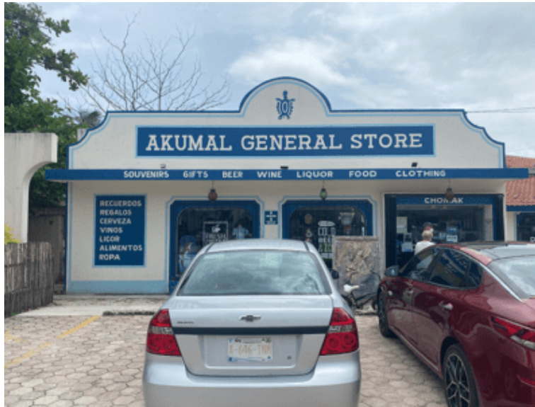
Free Parking To Shop

The Akumal General Store just before the Arch is the largest store in Akumal Playa. They have a wide selection of beverages, include beer and wine. The food selection is limited, though. You can get items like frozen pizza, eggs, cheese, chips and coffee. They don't sell fresh bread, meats and vegetables. The Akumal General Store also sells a good selection of essential household items like soap and toothpaste.