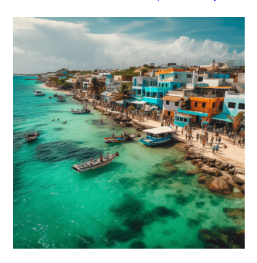
book a whale shark tour that leaves from akumal

Journey to a tropical sanctuary where cerulean waters lap against pristine white sand, creating an exquisite symphony of nature. Welcome to Isla Mujeres, the enchanting island just a stone's throw from Cancun, yet worlds apart. Here, life slows down, inviting you to savor each moment and indulge in pure leisure.