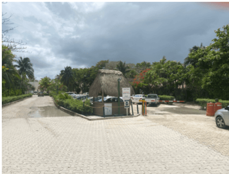
Pay Parking Lot In Plaza Ukana