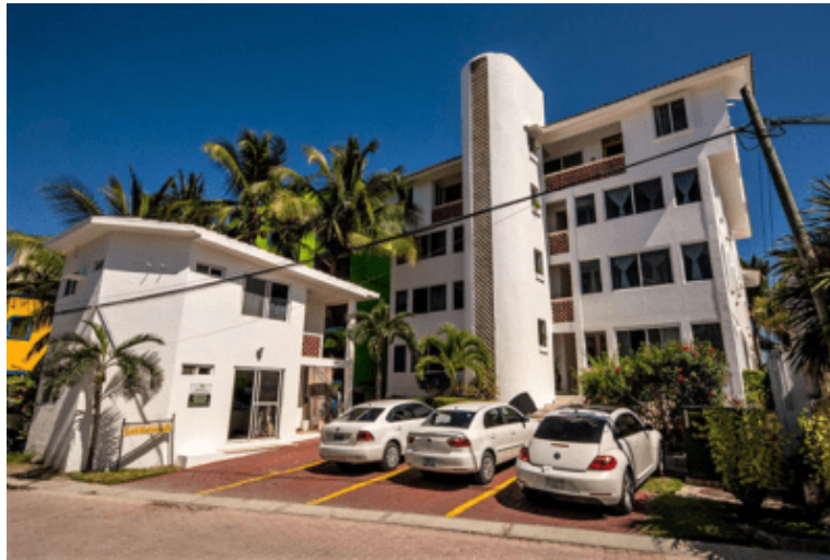
Free Guest Parking Outside Lol Ka'naab