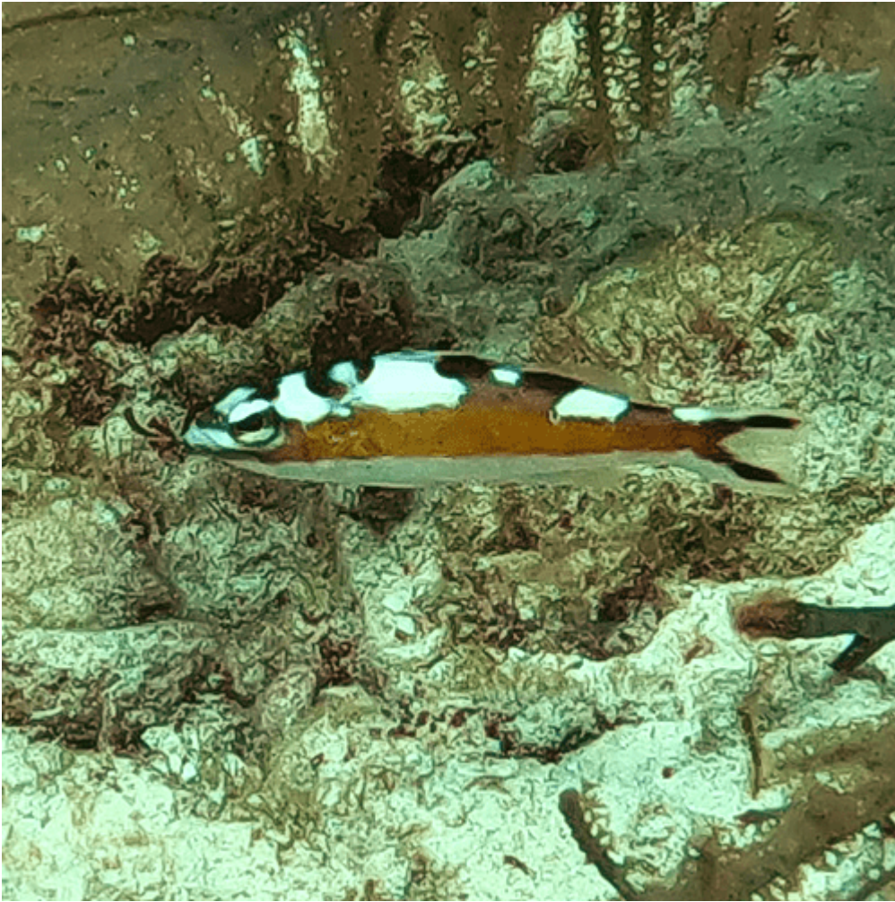
tobaccofish, serranus tabacarius