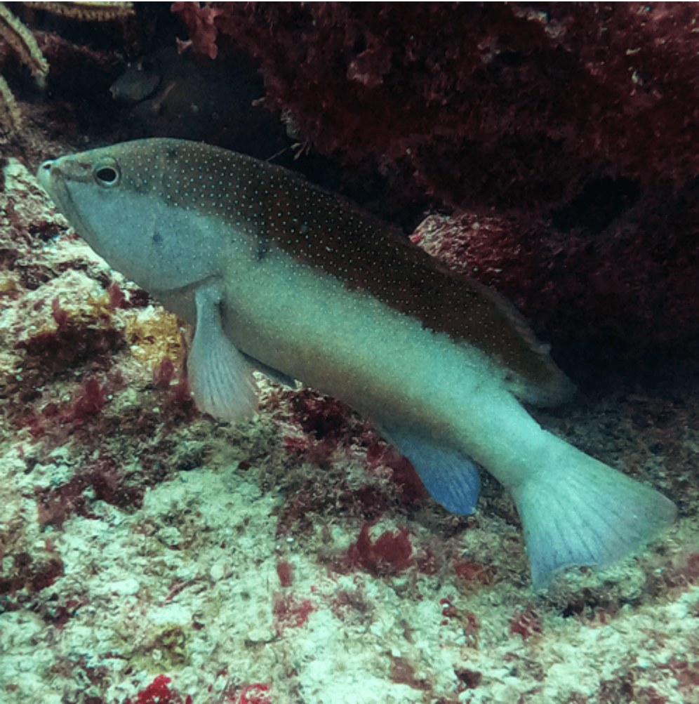
coney, Cephalopholis fulva