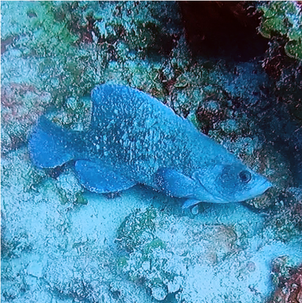
greater soapfish, rypticus saponaceus