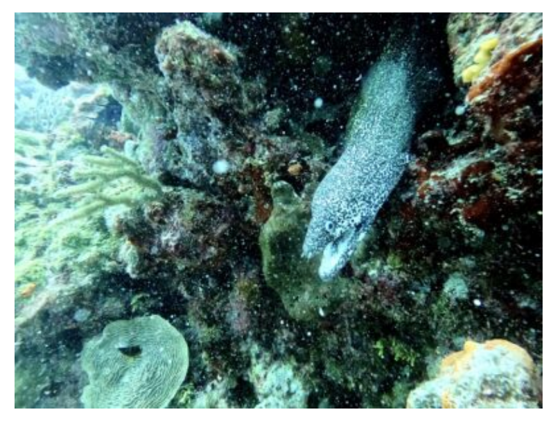
meet the locals