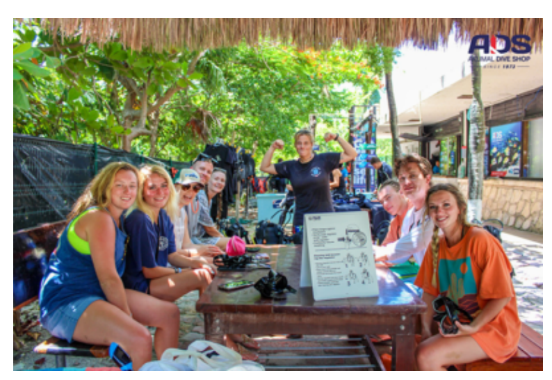
learn To Scuba Dive

unique underwater environments offer a one-of-a-kind experience. Adventure seekers can take their diving skills to the next level and explore the caverns, swimming through its mystical passageways and discovering its secrets. With a variety of caverns to choose from, each offering a unique diving experience, there's something for every level of diver.