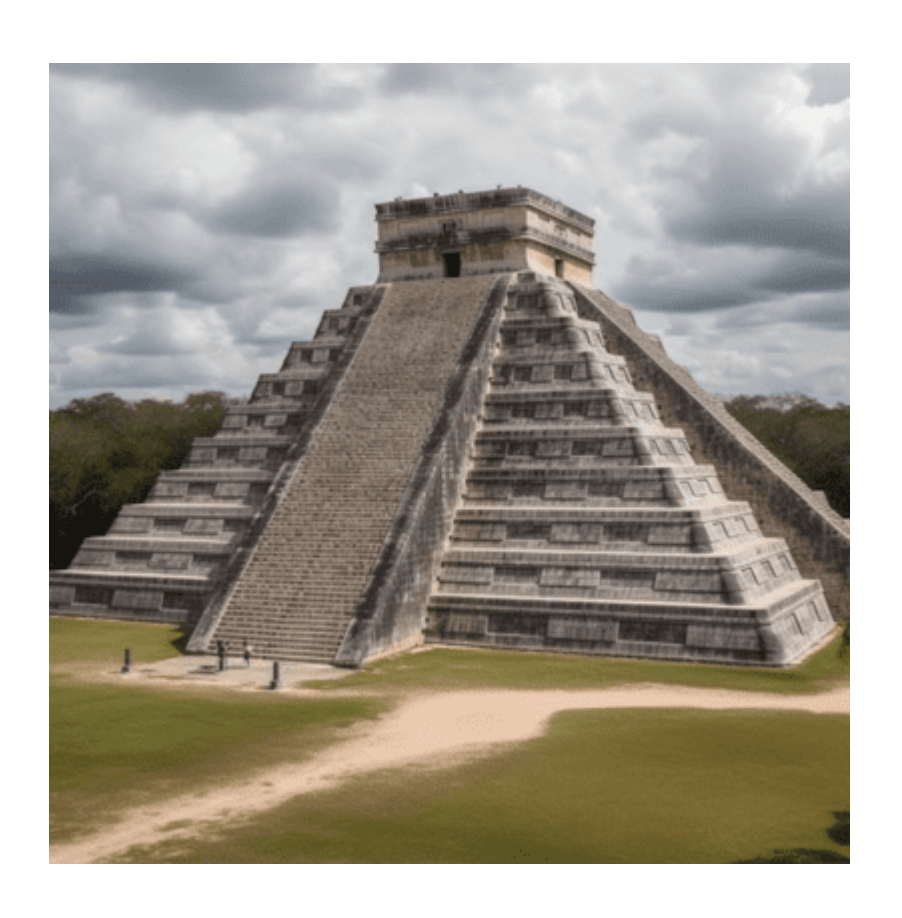
Chichen Itza with Valladolid Tour

As night falls, return to Valladolid's welcoming eateries and indulge in regional gastronomy. From flavorful Poc Chuc to mouthwatering Longaniza de Valladolid, local dishes are bound to tickle your tastebuds. Finish your meal with a sip of local liqueur, Xtabentún, a sweet testament to the Mayan heritage of Valladolid.